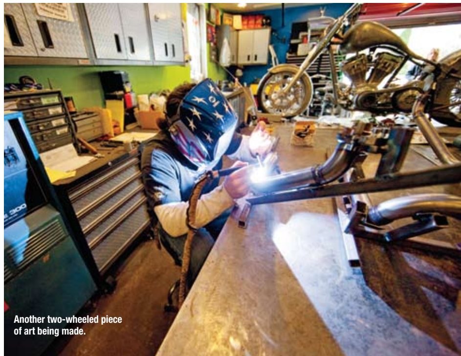
Another two-wheeled piece of art being made.