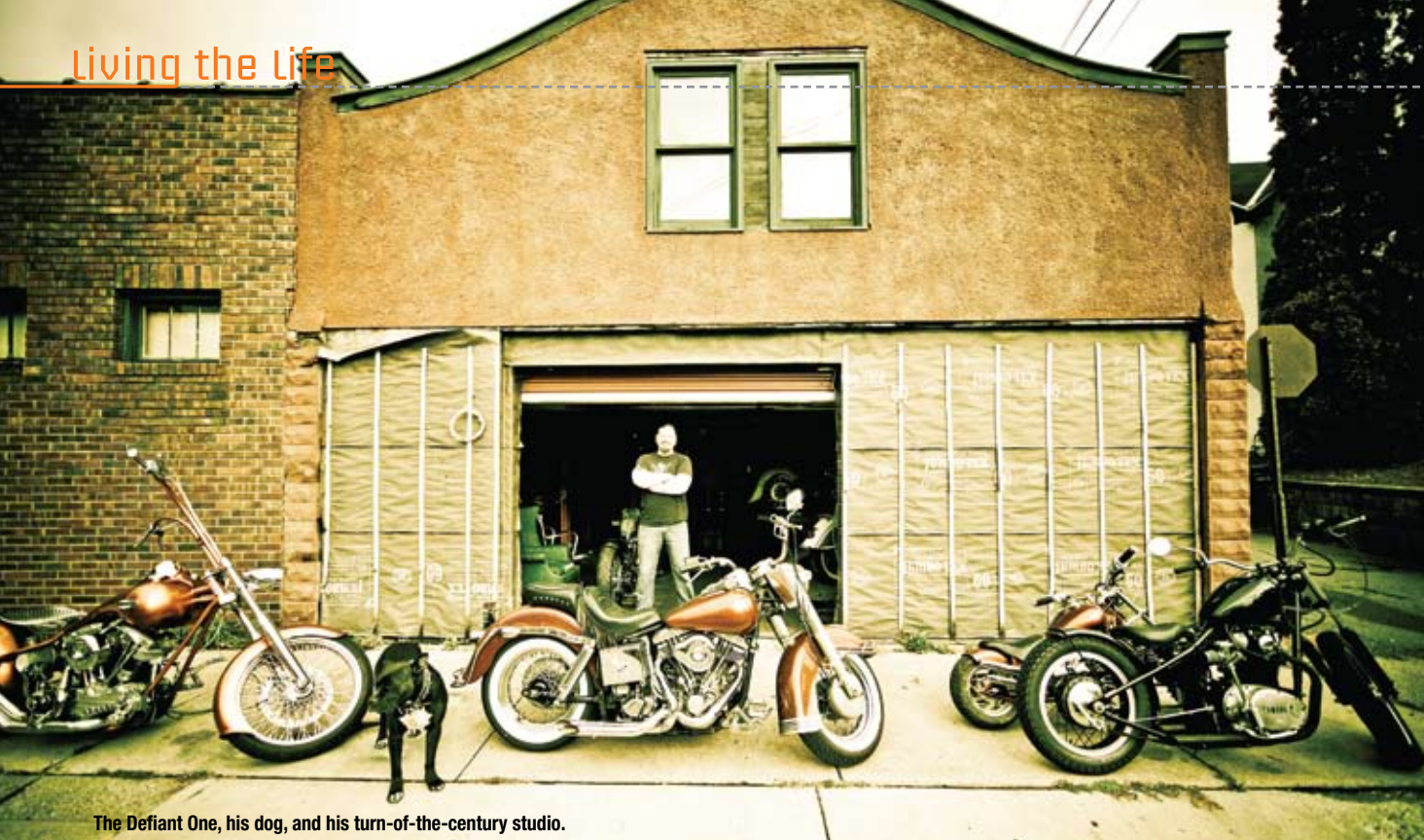
The Defiant One, his dog, and his turn-of-the-century studio.